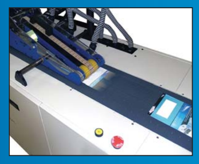
Fast, Easy and Flexible: The Product Attaching System's card feeder is synchronized for a superior tolerance range—you can place two cards on one piece.